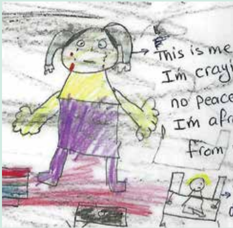
Children at Tilma's school draw pictures of the attacks they witnessed in their hometowns. While they draw, they tell their teachers about the events depicted in their drawings. The drawings are part of therapies used at her school to help traumatized children heal.