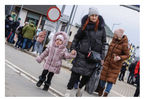
Ukrainians at the border

The United Nations reports that ten million Ukrainians have fled as a result of the Russian invasion in February, around a quarter of the population. Most of those fleeing are women and children. Many are traveling to neighboring countries to the west, primarily Poland, Romania, Slovakia, Hungary and Moldova. Packed trains and long lines of traffic have been steadily heading for the border.