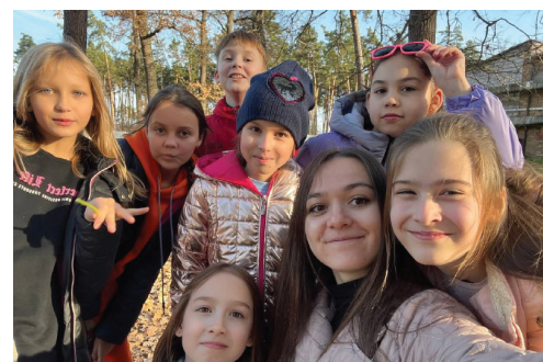
An Academy teacher with her students on the school campus in Bucha this fall

Last spring, TSI sent funds to purchase laptops for teachers to use for remote instruction after their devices were stolen or destroyed. Now, $6,000 will ensure both remote and in-person instruction continues through winter.